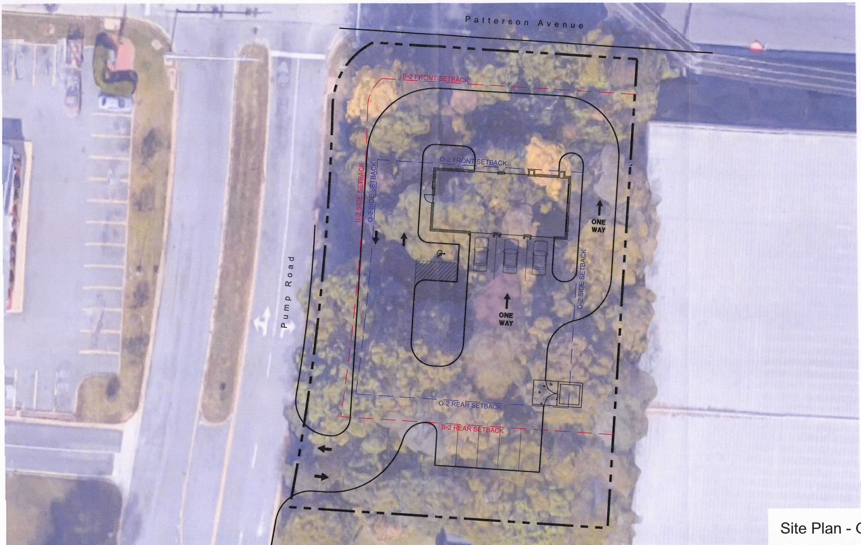
Site Plan - Option 1