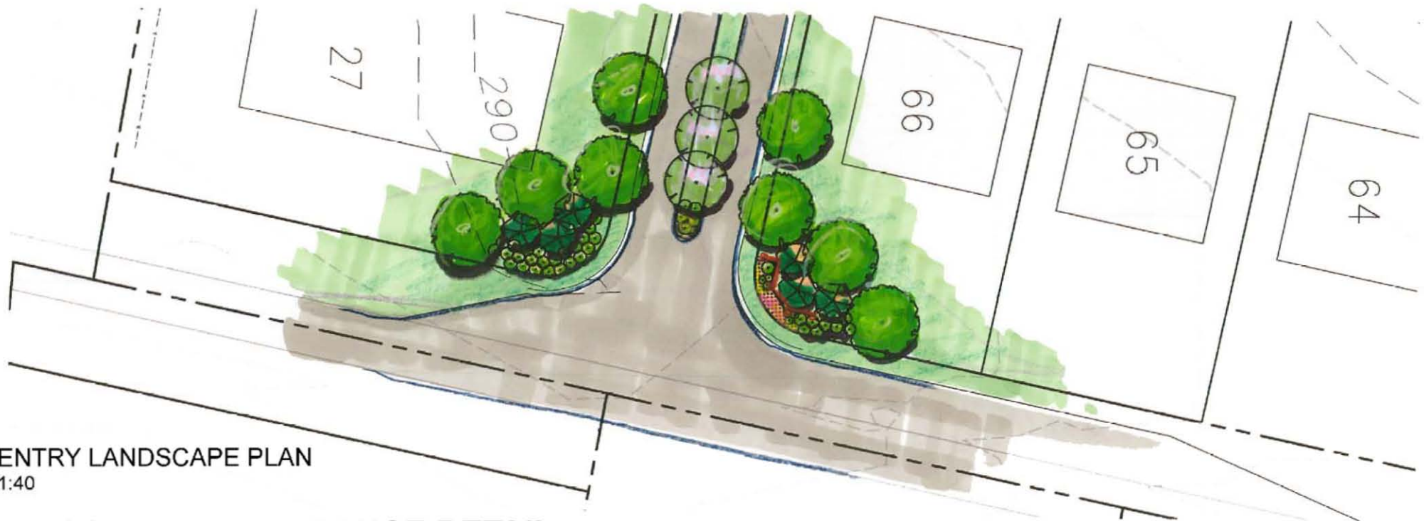
ENTRY LANDSCAPE PLAN 1:40