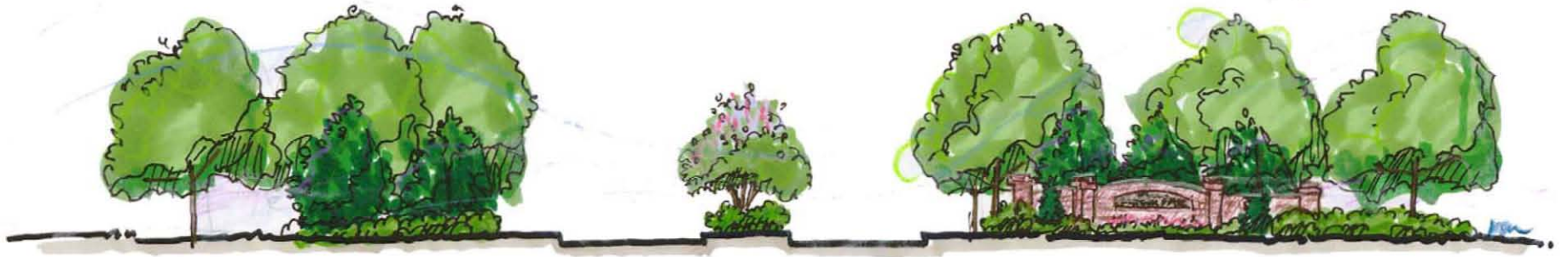
ENTRY ELEVATION NOT TO SCALE