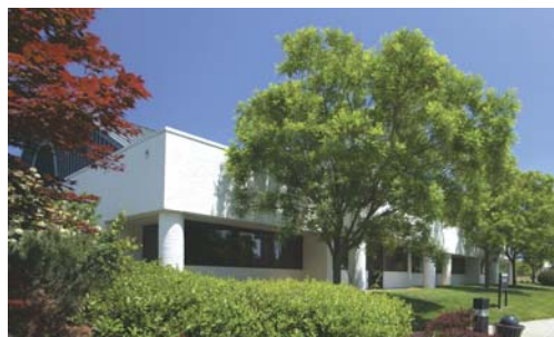
Eastern Government Center 3820 Nine Mile Road 652-3600