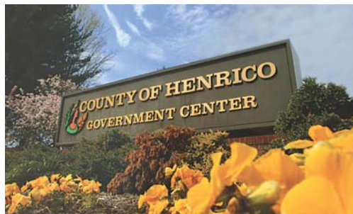
Government Center 4301 East Parham Road 501-4000