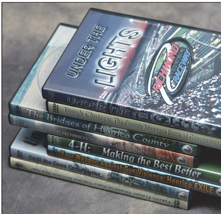
International sensation: A number of programs produced by HCTV-17 grabbed awards recently at a pair of top competitions — the 39 th annual WorldFest-Houston International Film Festival and the U.S. International Film and Video Festival.