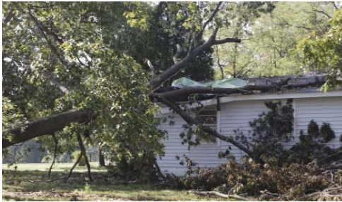
Having a plan can help your family manage the unexpected hardships that a disaster may leave on your doorstep.

For more information, log on to www.henricofire.org or call 501-5515.