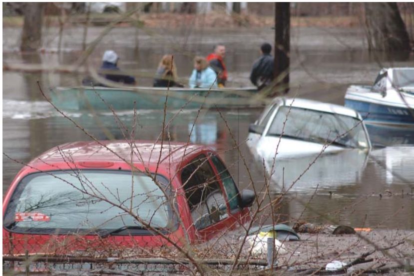
Disasters place a heavy burden on local government and residents alike. Planning and preparation are keys to navigating a crisis event, whether it's natural or manmade.