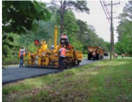
Henrico County is one of only two localities in Virginia to maintain its own roads. Shown here, a Public Works crew repaves a section of the county's 3,088 lane miles of roads.