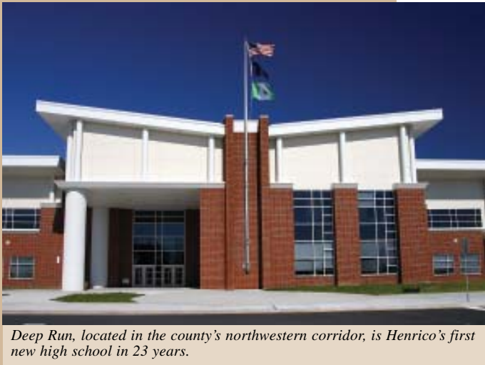
Deep Run, located in the county's northwestern corridor, is Henrico's first new high school in 23 years.

General District Court also jumped aboard the information superhighway creating an interactive, user-friendly Web site. Residents can now visit www.co.henrico.va.us/gendistcourt/ to access court calendars, magistrate information, fee and fine schedules, and a host of other court-related documents.