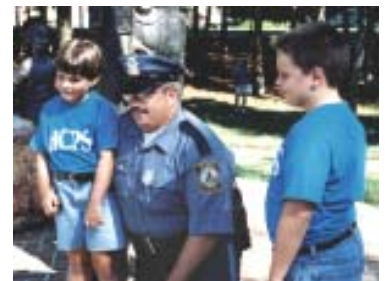
Last summer, Henrico County Public School students honored our public safety personnel with a musical thank you titled "What Can You Say to a Hero?"

Identifying and addressing the needs of aging commercial corridors has become an urban planning concern nationwide, and Henrico County is no exception. Last year, Henrico's Planning Office completed the Sandston Commercial Area Study—a lengthy, comprehensive, community-based examination of Varina's Williamsburg Road Corridor. Results outlined both short and long-term conceptualizations, including land use, landscape design, market analysis, public infrastructure, community character, traffic circulation and public safety. By examining the area's physical and economic needs, Planning staff, members of the community and professional consultants developed a realistic plan for the improvements and revitalization. Although still in its infancy, the plan has