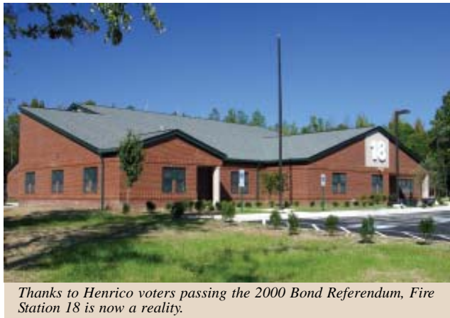
Thanks to Henrico voters passing the 2000 Bond Referendum, Fire Station 18 is now a reality.

Henrico's new Water Treatment Facility is nearing completion. As those residents living or working in the far west end can attest, construction has been steady since Henrico County began this endeavor in 1996. During the past year, crews were busy installing the 54-inch water transmission mains which will ultimately pump water from the James River into the Henrico County water system. Currently, the county purchases its drinking water from the City of Richmond. Henrico's Water Treatment Facility, which will ultimately treat up to 55 million gallons of fresh,