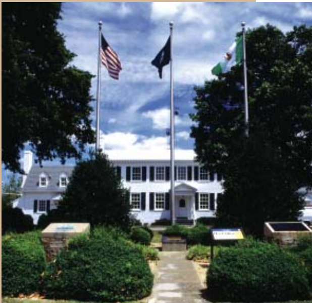
In 1883, Henrico County purchased Dabbs House, which served as the headquarters for Robert E. Lee during the Civil War. Today, it serves as the eastern headquarters for the county's Division of Police.

Also in FY02, the division's Uniform Operations officers developed and implemented the Problem Solving Policing pilot program in the county's Highland Springs area. Designed to reduce the number of repeat domestic violence calls, officers conducted extensive cross-agency research to identify common factors surrounding domestic violence disturbances. By coordinating with the county's Mental Health/Mental Retardation Services, the Victim Witness Program, Child Protective Services and other specialized agencies, officers were able to educate