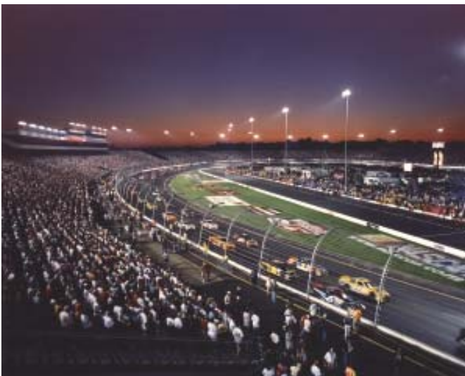
Race fans experience the height of excitement at the Richmond International Raceway, where Winston Cup NASCAR comes to Henrico County twice a year.

Henrico County's nationally recognized public school system continued on the path of excellence in FY02 as one of the top achievers in Virginia on the Standards of Learning (SOL) tests. The SOL tests, mandated by the Virginia Department of Education, measure student performance in math, science, social studies and language arts. Recent score results show that 91 percent of Henrico County schools are fully accredited, with significant increases in student pass rates at all grade levels. This incredible achievement is attributable to the focused, concerted efforts of