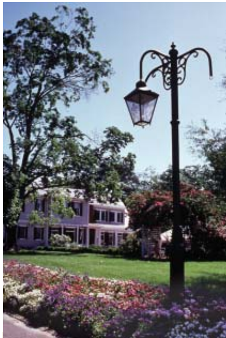
Year round, residents and visitors alike can soak in the beauty of Lewis Ginter Botanical Gardens.