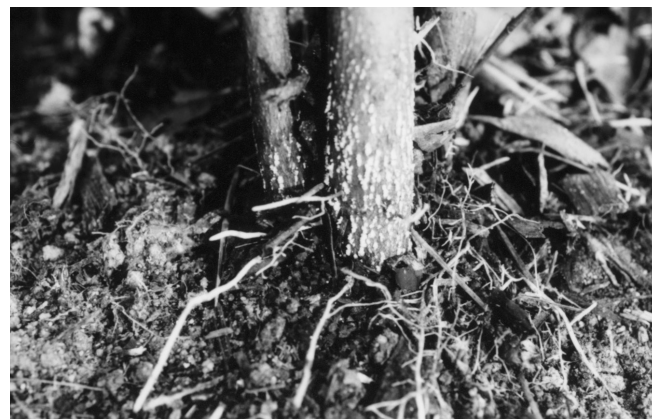
Figure 4. Piling excessive mulch against plant stems can stimulate undesirable shallow rooting in the mulch layer.

4.). If herbicides will be used in combination with mulches for enhanced weed control, apply the mulch first, then the herbicide over the mulch.