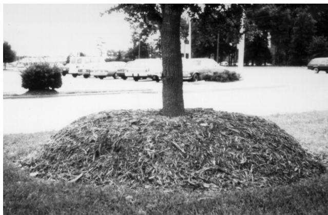
Figure 6. An improperly mulched tree. Bark layer too thick and piled up against the stem.