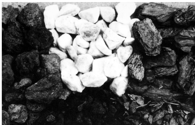
Figure 1. Loose mulch materials can be organic and inorganic, and of small or large particle size. Match the mulch type and size to the landscape situation.