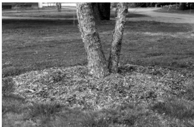
Figure 5. A properly mulched landscape tree.