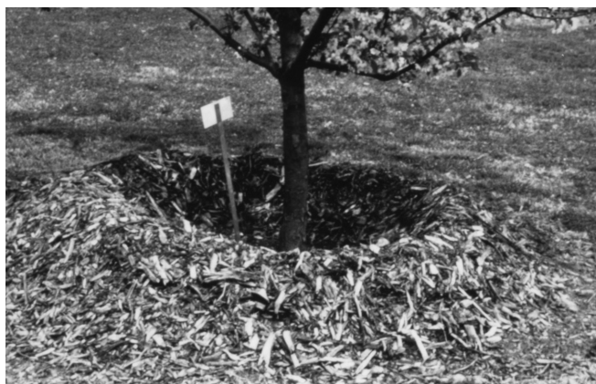
Figure 3. A mulch well can be constructed at planting time to help hold water over the rootball of the tree, but the height of this well is excessive.

Apply loose and sheet mulches at planting time. To prepare an area to be mulched, remove perennial weeds and level the area. Soil should be moist but not wet. Around young trees, extend the mulch from near the trunk out at least to the drip line (the ground area below the tree canopy (Figure 3.)). Established lawn trees will benefit from a mulched area extending 2'-3' out from the trunk. In all cases, keep the area adjacent to the trunk free of mulch to help prevent damage to the tree trunk from excess moisture, insects and diseases, and voles and other pests. Excessive mulching can also stimulate undesirable shallow rooting (Figure