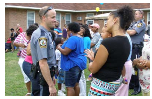
Henrico Police Division is committed to Fair and Impartial Policing and to developing positive relationships with all citizens.