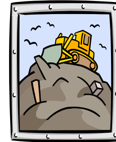
Trash and debris belong in landfills not in your neighborhood!

Junk belongs in the landfill, not in your neighbor's yard. This and other community maintenance issues