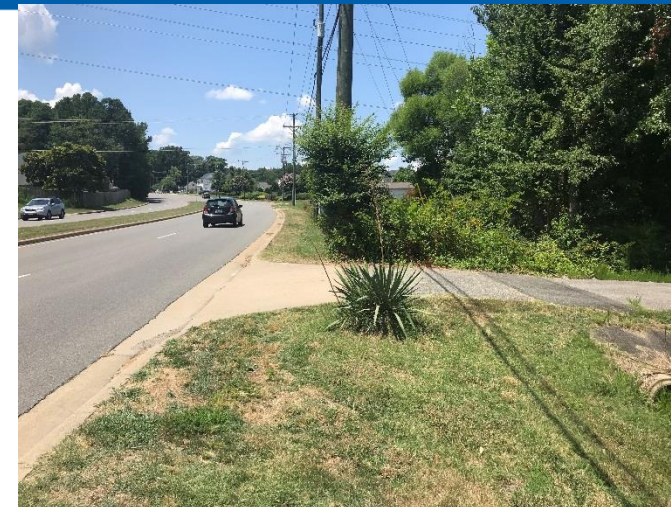
Existing Hungary Road future sidewalk location.

Anticipated Cost: Approximately $1,800,000