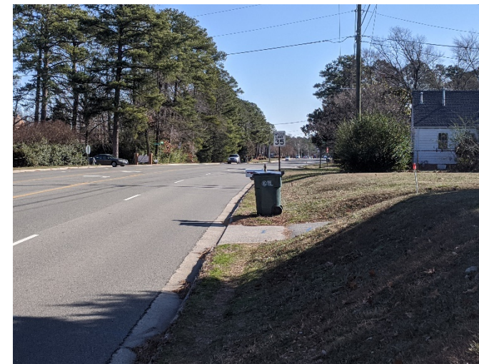
Existing Three Chopt Road future sidewalk location.

Anticipated Cost: Approximately $2,165,000