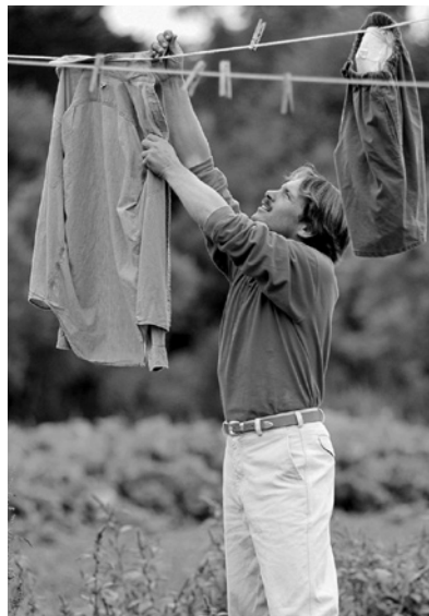
Flexibility in roles is essential in a healthy family.

Flexibility in roles is essential in a healthy family. Family roles naturally change over time. They also may change during times of crisis, such as when a family member becomes seriously ill or unexpectedly dies. The difference between healthy and unhealthy families in these situations is the healthy family's ability to adjust and adapt, which often requires a temporary or permanent shift in roles. In the case of illness or death, it is sometimes necessary for other family members to take on additional roles (e.g., becoming a financial provider).