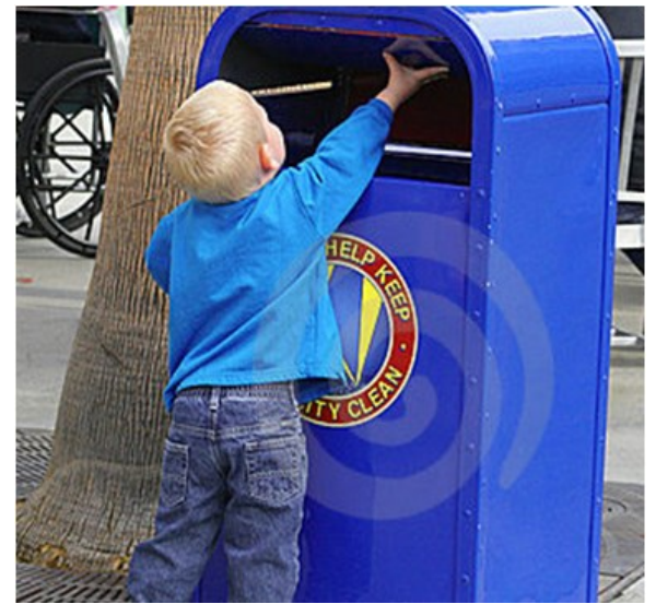
Put trash in the trash can.