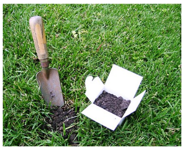
Have your soil tested.