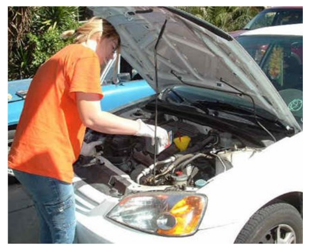
Keep your car in good shape.