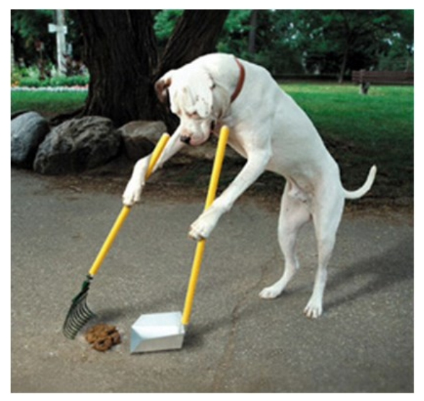
Pick up after your pet.

Here are some very simple things we can do to reduce or prevent non-point source pollution: