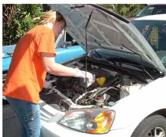
Keep your car in good shape.