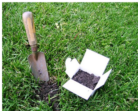
Have your soil tested.