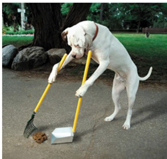
Pick up after your pet.

Here are some very simple things we can do to reduce or prevent non-point source pollution: