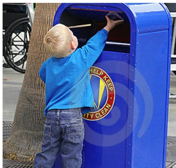
Put trash in the trash can.