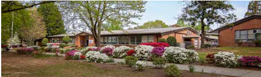
Tuckahoe Middle School will undergo a $28.2 million renovation as part of a $419.8 million bond package approved by Henrico voters in November. Overall, 26 projects will be funded countywide.

HPD has more than 840 personnel, including more than 620 sworn officers. The division’s approved budget for the upcoming 2017-18 fiscal year is $73.5 million and includes funding for 10 new officers. Last year the division responded to more than 215,500 calls for service. ■