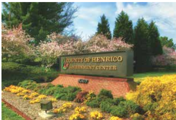
GOVERNMENT CENTER 4301 East Parham Road 501-4000

Henrico County P.O. Box 90775 Henrico, VA 23273-0775 (804) 501-4257 henrico.us/pr