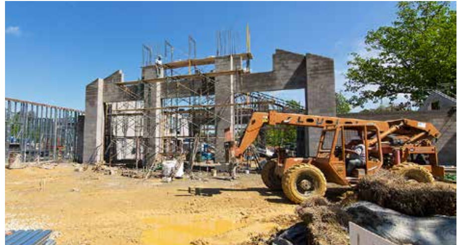
Henrico's budget for fiscal year 2017-18 will fund the operations of the Short Pump Firehouse. The station is under construction on Kain Road and is expected to open in February.

Henrico County Public Schools will receive $469.9 million, or 56 percent of the general fund. An additional $177.2 million, or 21.1 percent, will support public-safety functions, including the Police and Fire divisions, the Sheriff's Office, juvenile