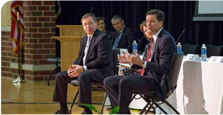
Chuck Rosenberg (left), acting administrator of the Drug Enforcement Administration, and James B. Comey (right), at the time director of the FBI, discuss the dangers associated with increased abuse of heroin and other opioids as part of a community summit held March 1 at Glen Allen High School.