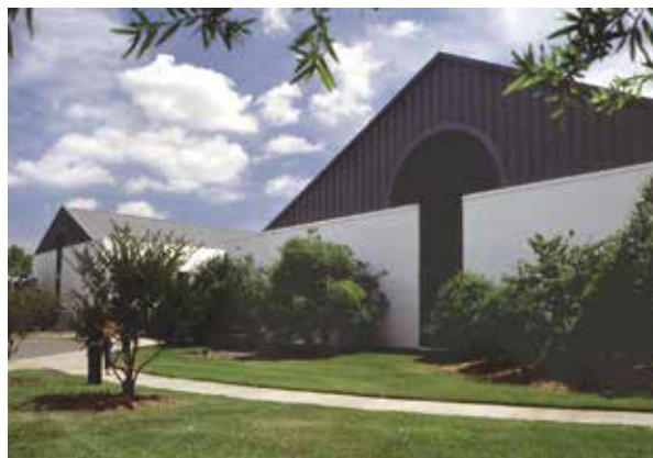
EASTERN GOVERNMENT CENTER 3820 Nine Mile Road 652-3600