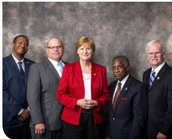
Henrico County Board of Supervisors, 2017.

For more information about voting, contact Henrico's Voter Registration and Elections Office at (804) 501-4347 or go to henrico.us/registrar .