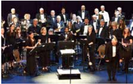
Henrico Concert Band Patriotic Concert June 26